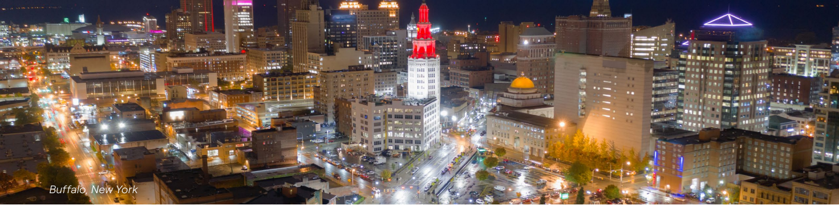
Buffalo, New York

maximum value with minimum impact on your operations. We outline these measures in a detailed Dispatch Participation Plan.