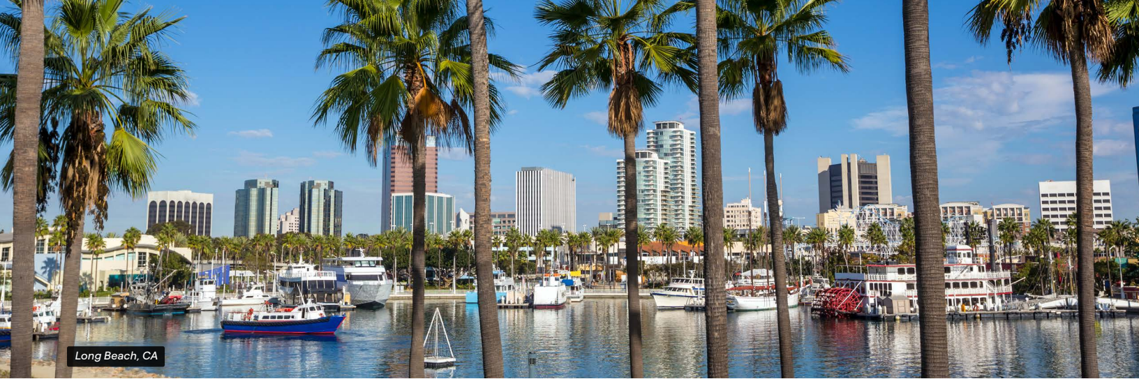
Long Beach, CA

Center (NOC), so we can monitor your energy consumption levels in real time.